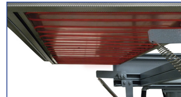
Infrared Heater Panel Featuring: 15,000 Watts of 0 - 100% Heat Controlled

For more information please contact your Belovac Representative at 951-741-4822 or at jb@belovac.com or visit www.belovac.com