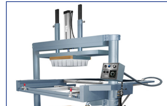
Option: Vacuum Former with Overhead Assist